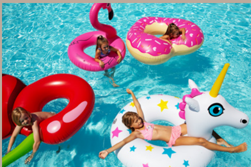
KIEPOS Kids' Club