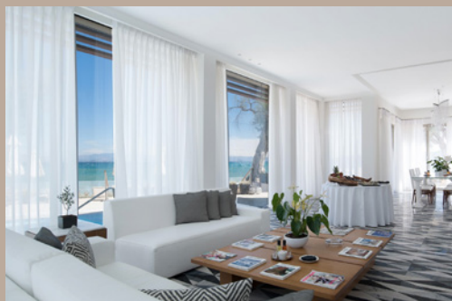
Haute Living Selection